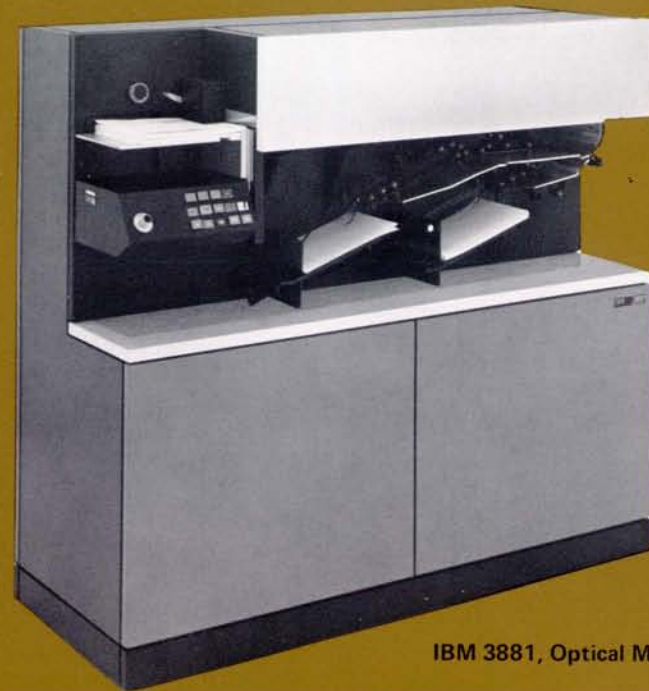
IBM 3881, Optical Mark Reader

Model II Off Line to a 3410 Model 1 Magnetic Tape Drive