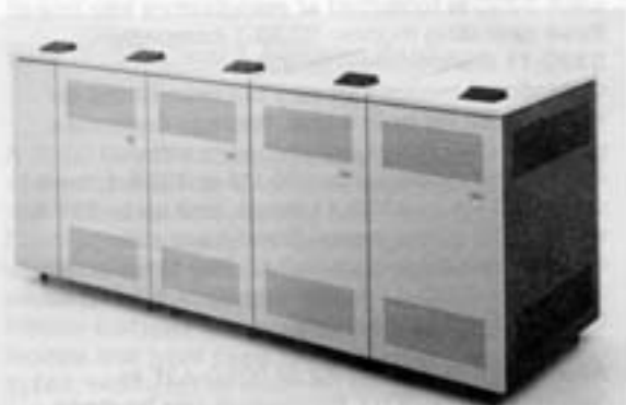
IBM 3370 (Similar in appearance to the IBM 3375)

The IBM 3370 Direct Access Storage subsystem combines two important concepts: two independent actuators each servicing half of a single stack of storage disks, and fixed-block architecture.