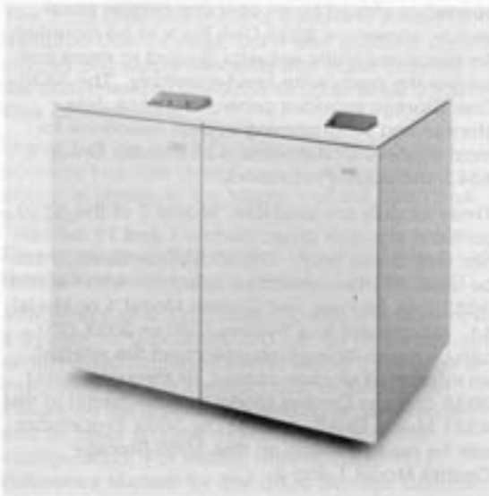
IBM 3310 Direct Access Storage Unit, Model 3310-1, with 3330X Processor, Model 3330X/3350, Storage Controller, Model 3330X/3350/3340/3344/3370/3375, and IBM 4331 Processor, Model 4331-1, via the DASD Adapter.

The basic unit of transfer between the disk storage device and the 4331 is a fixed block sector of data of 512 bytes.