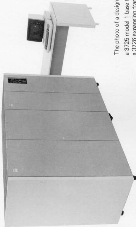
The photo of a design model shows: a 3275 model 1 base frame a 3276 expansion frame a 3277 operator console